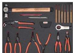
26" [543 x 445 mm]