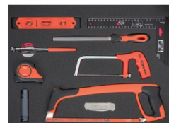
26" [543 x 445 mm]