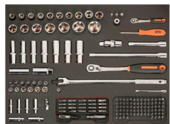
26" [543 x 445 mm]