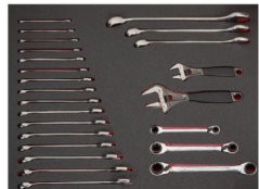
26" [543 x 445 mm]